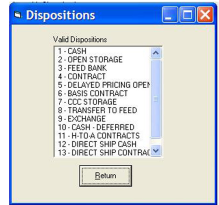
User defined dispositions